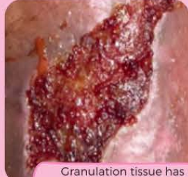
Granulation tissue has a marble appearance!