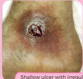
Shallow ulcer with irregular borders over bone