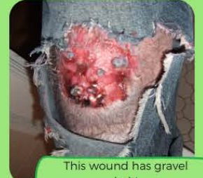
This wound has gravel in it!